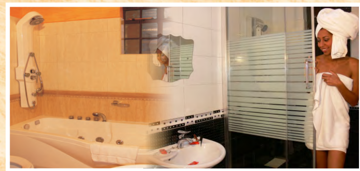
Rustic Tiles instill the Massage Bath with timeless glamour

Relax in our exquisite massage bathtubs and tastefully decorated shower cubicles.