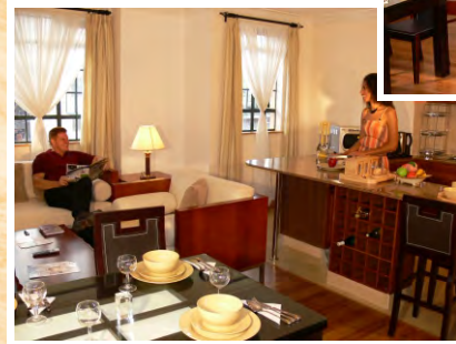
Your table is ready